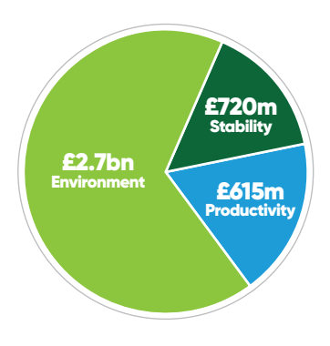
DIVISION OF FUNDING

While the modelled budget does not capture every spending requirement, due to the interactions of funding need with policy design which are difficult to fully account for, it does provide a strong indication of the level of budget required to deliver a globally competitive, productive, resilient, innovative and sustainable agricultural sector that would drive significant environmental improvements at unprecedented scale.