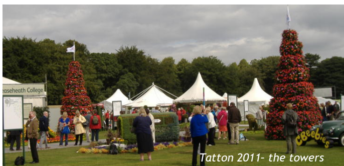
Tatton 2011- the towers

Reaseheath College staff and students will be planting and growing the 3000+ plants of the trailing Petunia Fanfare in three colours, red-white & blue for a patriotic display on the towers that were used to great effect last year with Sunpatiens.