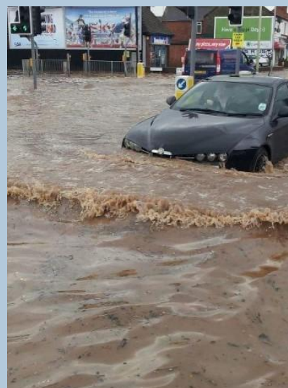
Flooding in Loughborough in June 2012

The rain was so intense that we issued flood warnings in areas suffering from drought. In those areas, groundwater remained depleted and took some time to recover before the temporary use bans could be lifted.