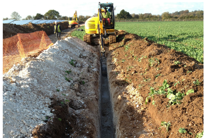
Cable trenching, showing topsoil stripped and set to one side, with subsoil placed on the other side ready for reinstatement