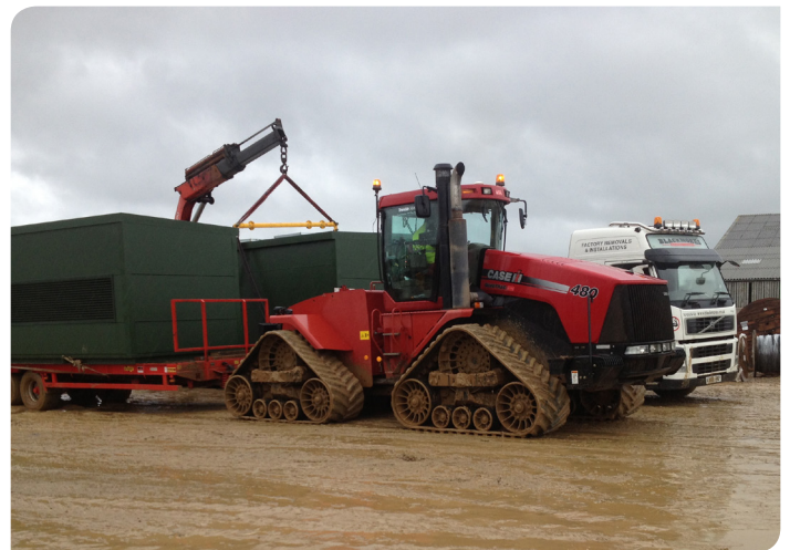
Case Steiger Quadtrac used to deliver inverters and other heavy equipment to site under soft ground conditions

A number of preliminary studies on the quantity and quality of forage available in solar farms have suggested that overall production is very little different from open grassland under similar conditions. A more comprehensive and independent evidence base could be established through a programme of directed research, e.g. by consultants (such as ADAS) or interested university groups (e.g. Exeter University departments of geography and biosciences), perhaps in association with seed suppliers and other stakeholders. Productivity of grasses could be compared between partial shade beneath the solar modules and unshaded areas between the rows. Alternatively daily live weight gain could be compared between two groups of fattening lambs (both under the same husbandry regime) on similar blocks of land, with and without solar modules present.